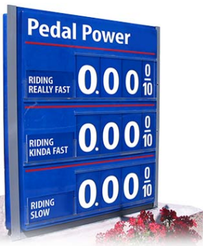
You do the math.